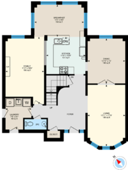
Main Floor Exterior Area 1263 sq ft