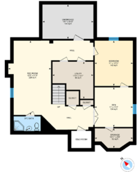
Basement (Below Grade) Exterior Area 1244 sq ft