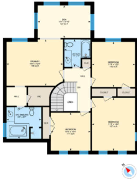
2nd Floor Exterior Area 1257 sq ft